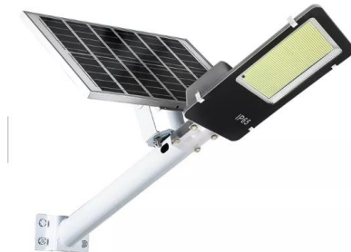
500w Aluminum streetlight separate

WE ACCEPT PRE- ORDERS OF OTHER SOLAR STREETLIGHT MODELS, ROAD STUDS, & FANS.