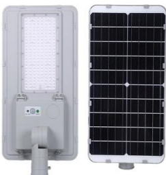
180w Aluminum integrated